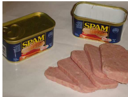
Hormel Foods Corporation, since 1937 see http://www.spam.com