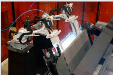
IMPROVED PART ACCESS