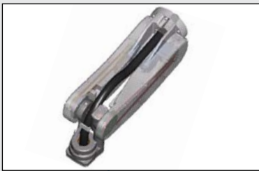
PATENTED ARM DESIGN