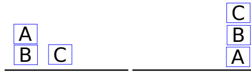
Figure 1: Left: initial position, Right: goal position