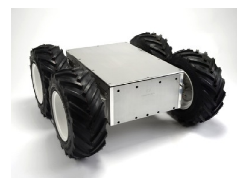
Figure 1: Example of the four-wheel robot.

This project aims to implement UKF and use it to filter data obtained from noisy and inaccurate sensors to obtain filtered state of a nonlinear system which represents tank—like four—wheel robot position and orientation. Since not all sensor parameters are perfectly known it is necessary to optimize assigned stochastic sensor parameters to minimize Mean Square Error (MSE) of the estimated robot position. More information and details will be specified in the following section.