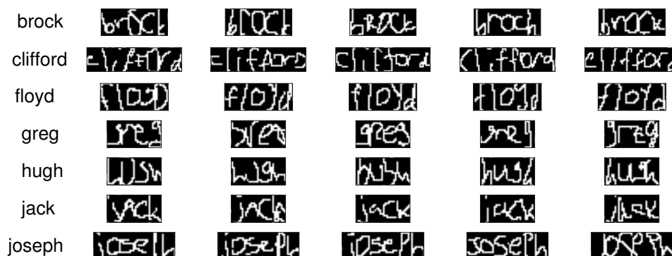
Figure 1: A sample of the input images for a selected sub-set of names.

The input is a binary image \mathcal{I} = (\mathcal{I}_1, \dots, \mathcal{I}_L) \in \{0, 1\}^{16 \times 8 \cdot L} displaying a sequence of L handwritten characters. Each sub-image \mathcal{I}_i \in \{0, 1\}^{16 \times 8} , i \in \{1, \dots, L\} , is of fixed size hence the segmentation of the image \mathcal{I} into characters is known. We represent the input image \mathcal{I} by a matrix \mathbf{X} = (\mathbf{x}_1, \dots, \mathbf{x}_L) \in \mathbb{R}^{d \times L} where d is the number of features. The i -th column \mathbf{x}_i \in \mathbb{R}^d is a feature description of the i -th sub-image \mathcal{I}_i . The feature vector \mathbf{x}_i contains the intensity values of \mathcal{I}_i and un-ordered products of the intensity values computed from all different pixel pairs of \mathcal{I}_i . Therefore the number of features is d = 16 \cdot 8 + (16 \cdot 8 - 1)(16 \cdot 8)/2 = 8256 . In addition, each feature vector is normalized to have a unit L_2 -norm.