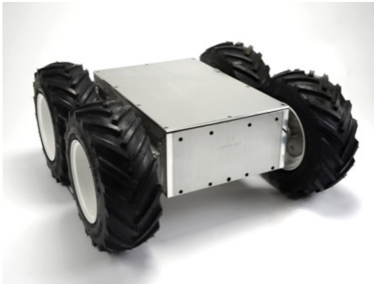
Figure 1: Example of the four-wheel robot.

This project aims to implement UKF and use it to filter data obtained from noisy and inaccurate sensors to obtain filtered state of a nonlinear system which represents tank-like four-wheel robot position and orientation. Since not all sensor parameters are perfectly known it is necessary to optimize assigned stochastic sensor parameters to minimize Mean Square Error (MSE) of the estimated robot position. More information and details will be specified in the following section.