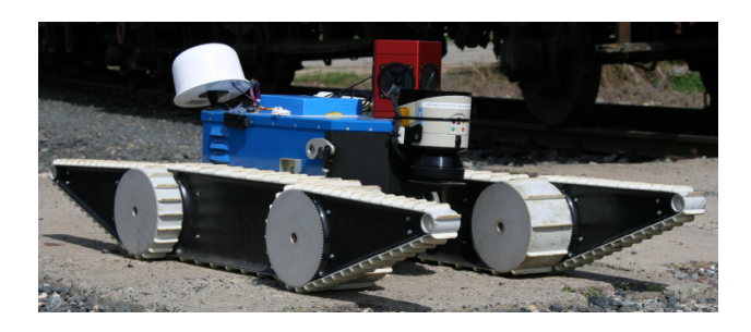
Figure 1: The NIFTi robot.

The NIFTi robot is being developed in the NIFTi project [3]. It involves 6 different European universities, two fire departments and a robot manufacturer. The robot should be suited for outdoor conditions. One of its purposes is to take part in Urban Search and Rescue (USAR) missions, where it should map the situation and help locate victims of a catastrophe. The robot is shown in the Fig. 1.