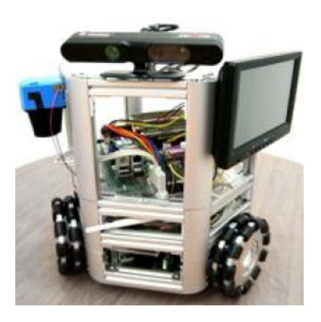
Figure 2: The Quanti robot.